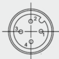
M12 4 Poles (Power supply)

PIN 1: + 24 Vdc PIN 2: Reserved PIN 3: Ground PIN 4: Reserved